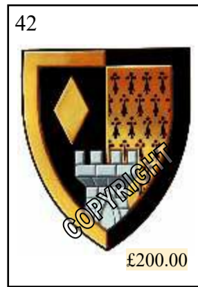
Macdonald Hotels PLC