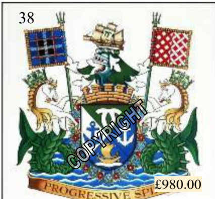
The City of Kobe