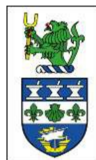
Shield & crest

What is the Cost? The cost would be from £80.00 for designing the shield and crest and would depend on the complexity of your design and £18.00 for each subsequent sketch if there are extensive amendments. Once you have approved the artwork you can choose a style of mantling from any of the illustrations shown or you may send in a particular style which you would like me to follow. (This would be reflected in the price.) Your motto may be included and I shall send a quotation for the final artwork.