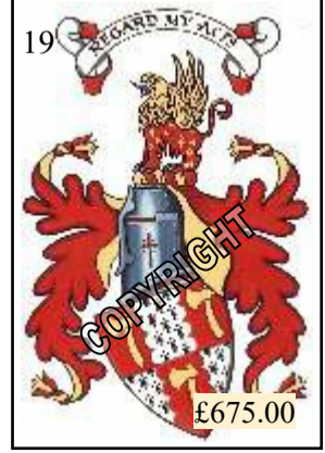
Arms with Baronial additaments