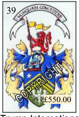
Trump International Golf Club Scotland Limited