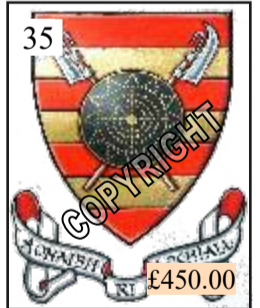
Clan Cameron Association