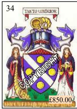
Bank of Scotland